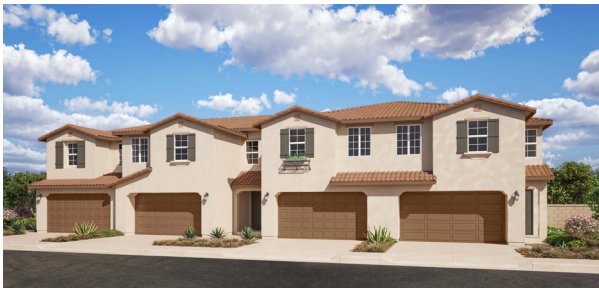
Santa Barbara Elevation